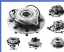
Wheel Hub Bearing