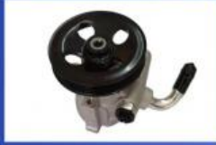
Power Steering Pump