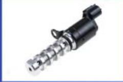
Oil Control Valve