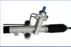
Power Steering Rack