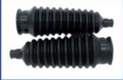
Steering Gear Boots