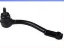
Tie Rod End