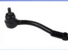
Tie Rod End