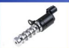
Oil Control Valve