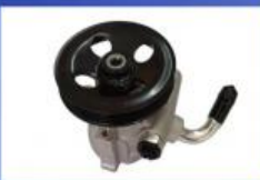
Power Steering Pump