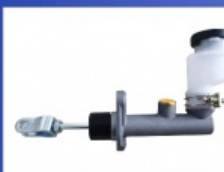
Clutch Master Cylinder