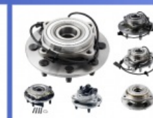
Wheel Hub Bearing