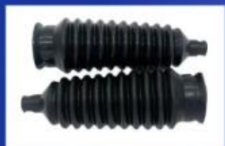
Steering Gear Boots