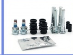
Brake Repair Kit