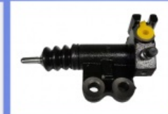
Brake Slave Cylinder