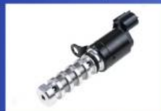
Oil Control Valve