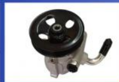
Power Steering Pump