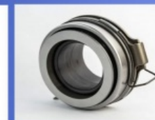
Clutch Release Bearing