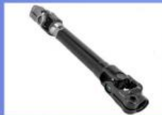
Steering Column Shaft