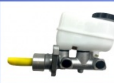
Brake Master Cylinder