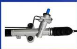
Power Steering Rack