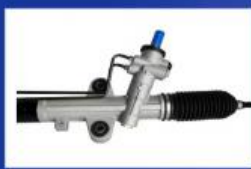
Power Steering Rack