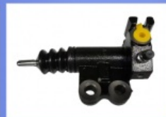
Brake Slave Cylinder