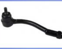
Tie Rod End