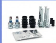
Brake Repair Kit