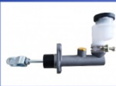
Clutch Master Cylinder