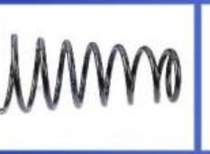
Shock Absorber Spring