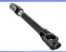
Steering Column Shaft