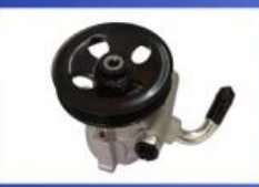
Power Steering Pump