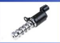
Oil Control Valve