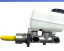
Brake Master Cylinder