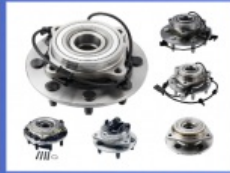
Wheel Hub Bearing