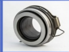
Clutch Release Bearing